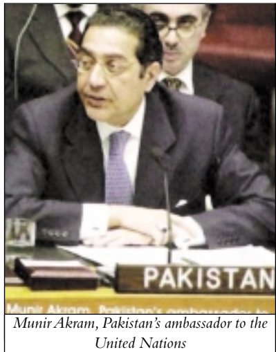
Munir Akram, Pakistan's ambassador to the United Nations

Thus the country has been a target of threats from extremists across the world.