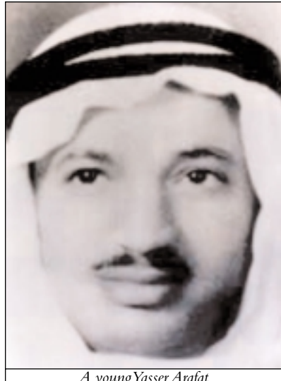
A young Yasser Arafat

After four years in Jerusalem, the young Arafat returned to Cairo where his