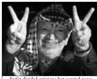
Arafat divided opinions but wanted peace

This brief spell of progress towards peace failed to materialise and any resolution to the delicate situation in the Palestine looked increasingly unlikely when Yitzhak Rabin was assassinated and the right-wing politician, Benjamin Netanyahu came to power in 1996.