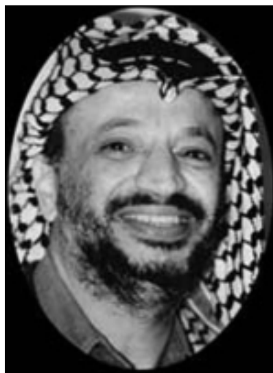
Yasser Arafat: respected, admired, loved

He will be remembered as an unmovable, dedicated and loyal resistance fighter to the Palestinian struggle. His leadership divided opinions, but his goal was peace.