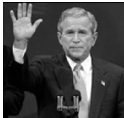
President Bush waves during a victory rally Wednesday in Washington.

the coming scandal, whether financial or merely moral, is that it may well go undetected and unreported. With solid majorities in both houses, a partisan Republican Congress will cease to provide a check or balance on the power of the executive branch. To call the Republicans in Congress the lap dogs of the White House is to insult Chihuahuas everywhere - they at least bark on occasion. It is no surprise that Bush has been the first president since the earliest days of the republic not to use his veto power. With ethically challenged Majority Leader Tom DeLay having an even larger majority in the House, there will be no challenge to the administration from that quarter.