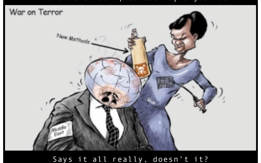
Says it all really, doesn't it?

www.arabnews.com | cartoon by amjad rasmi